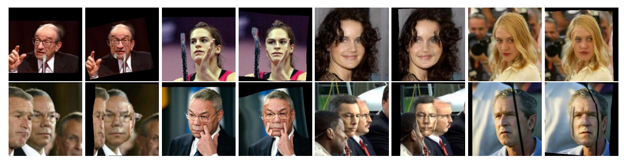
Figure 6. Some fail results due to occlusion in LFW database.

Occlusion could also lead to fail normalization results since we fill the invisible region with face symmetry, see Fig. 6.