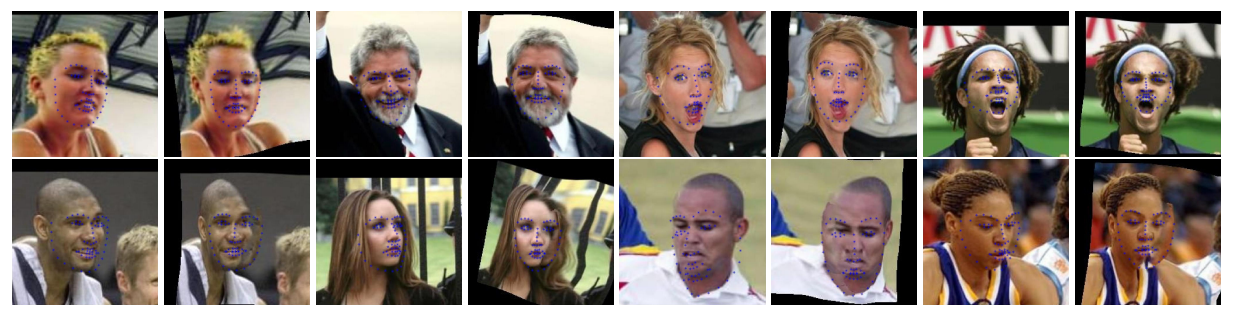
Figure 5. Some fail normalization results due to bad landmarks in the LFW database. The first row are the input images, where the blue points are detected 2D landmarks. The second row are the normalization results, where the blue points are the landmarks of 3D model

Since the 3DMM fitting directly depends on the detected landmarks which may be inaccurate in some cases, we demonstrate some fail normalization results due to bad landmarks, see Fig. 5.