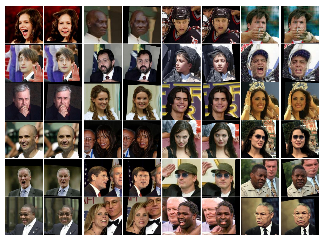
Figure 1. Normalization results on LFW database. For each pair, the left is the original image, the right is the normalized image

In this section, we demonstrate some normalization results of LFW samples in Fig. 1