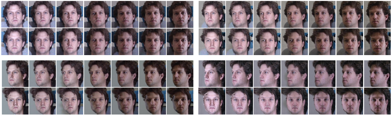
Figure 4. The normalization results of MultiPIE with pose and illumination variations. We demonstrate faces in poses of (0^{\circ}, -15^{\circ}, -30^{\circ}, -45^{\circ}) under illuminations from 1 to 7. The first row is the input images, the second row is the normalization results.