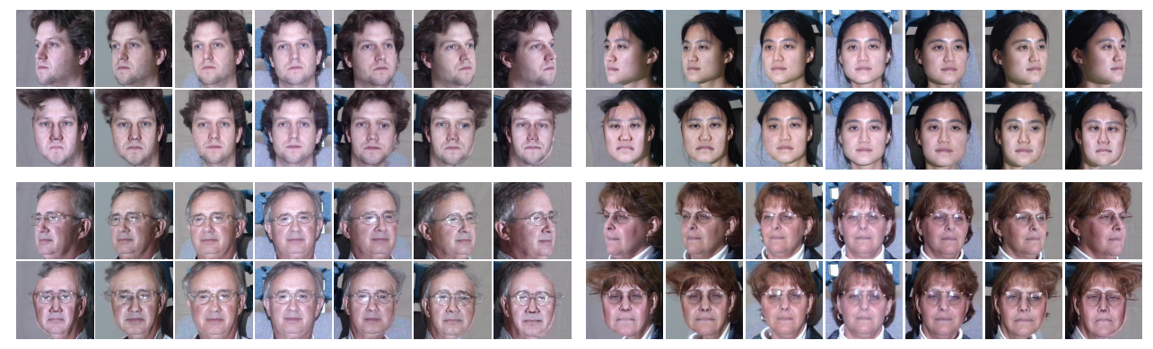
Figure 2. The normalization results of MultiPIE with pose variations (-45^{\circ}, -30^{\circ}, -15^{\circ}, 0^{\circ}, 15^{\circ}, 30^{\circ}, 45^{\circ}) . For each subject, the first row is the input images, the second row is the normalization results. Note that faces in -45^{\circ} are directly mirrored

In this section, we demonstrate the normalization results with pose variations in Fig. 2, simultaneous pose and expression variations in Fig. 3 and simultaneous pose and illumination variations in Fig. 4